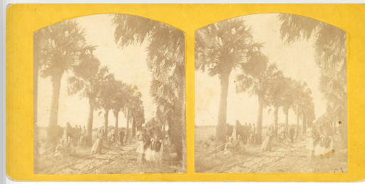
Croquet Party Fernandina Beach from the 1870s stereoscopic picture